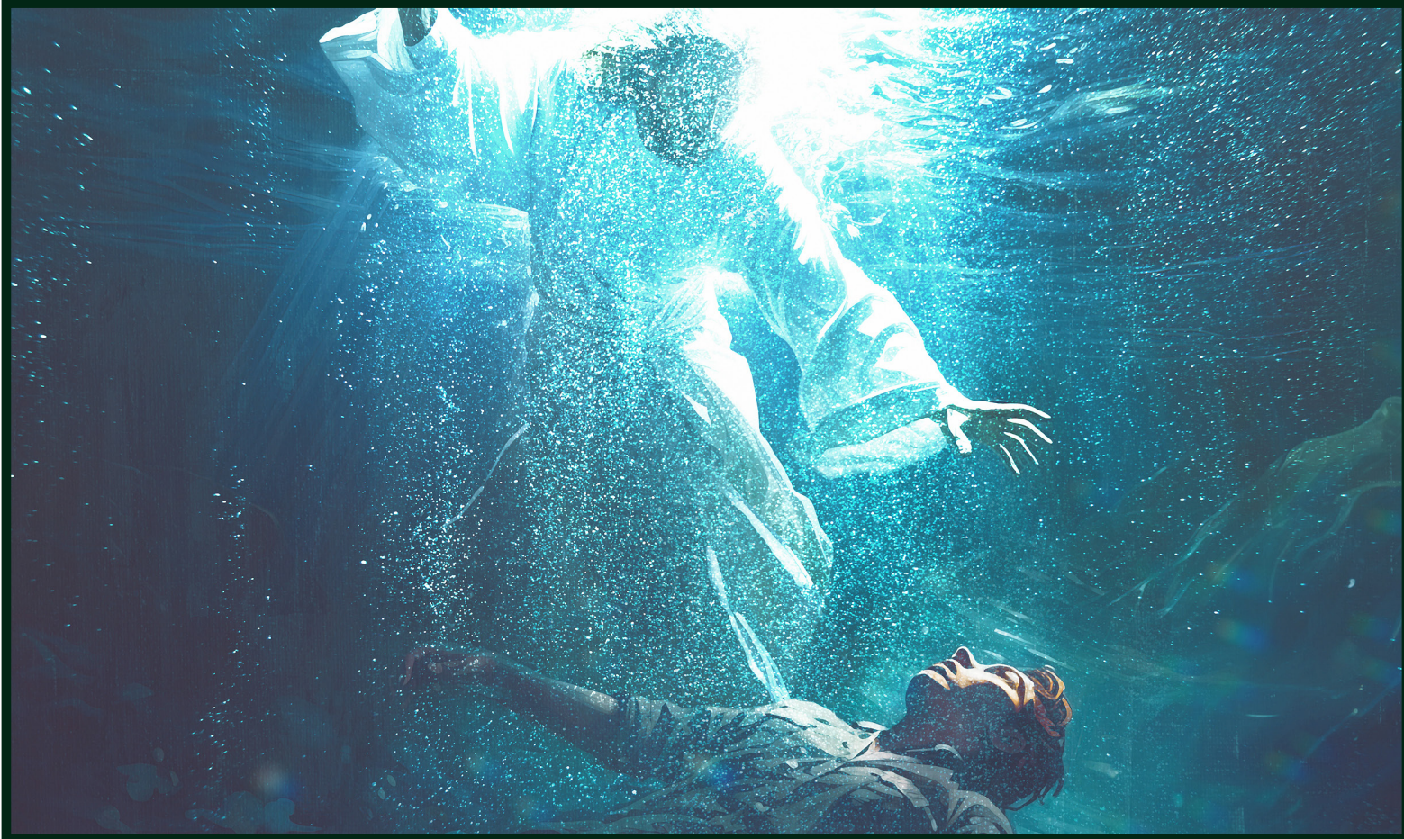
Cover Art: 'Jesus Rescues' by Kevin Carden @kevincardenart