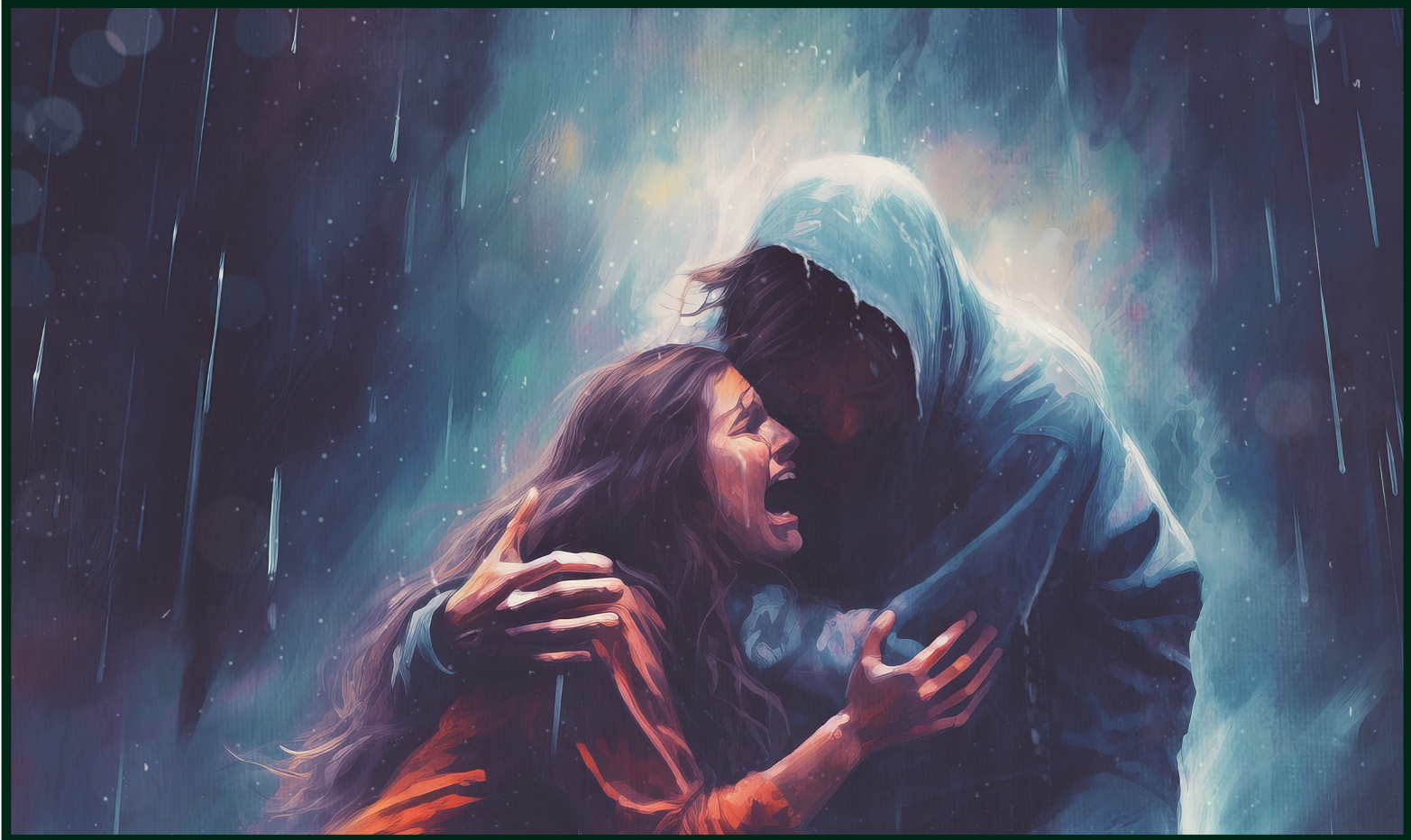
^Cover art: @kevincardenart | Get new zines at --> mustardseedzine.com